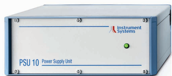
▲ PSU 10 power supply unit.

Firstly, the PSU 10 includes a power source which supplies a steady LED current of 250 mA to ensure constant optical radiant power. In addition, this module supplies power to the fan built into the ACS 570-15/17. Secondly, the TEC controller ensures that the LED temperature is kept constant at 35 °C. The PSU 10 is connected to a computer with an USB link and controlled via the PSU-ACS-Control software. The Windows 7/10 operating systems are supported. The corresponding program libraries are available for the Windows and OS X operating systems (.dll and .dylib) for direct control. Alternatively, a Keithley 24xx can be used as a current source and an Arroyo 5305 as TEC controller.