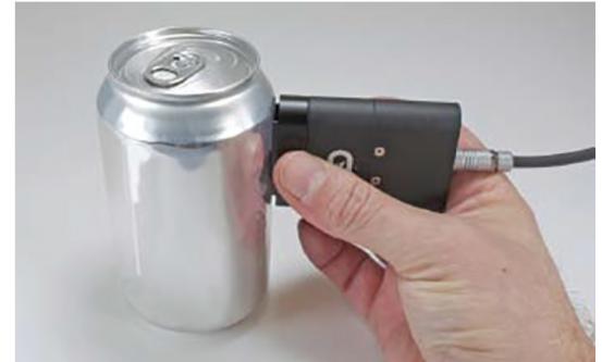
Note: Flex 20 measurement area 6x6 mm. With optional adapters 2x2 mm & 4x4 mm measurement area.