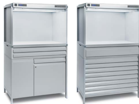
CMB-2540/LED shown with two shallow flat file drawers and storage cabinet at left; and shown with one deep file drawer and eight shallow flat file drawers at right.