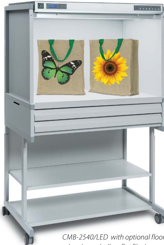
CMB-2540/LED with optional floor stand and two shallow flat file drawers

Premier LED Viewing Booths for Color Matching and Inspection