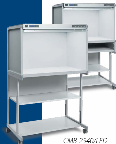
CMB-2540/LED with floor stand on left; and with floor stand and table riser on right.