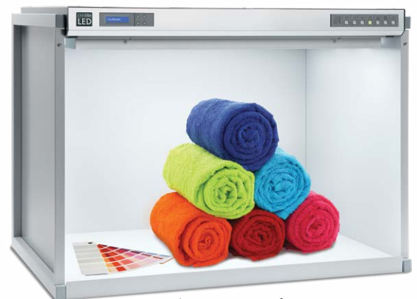
Desktop version of CMB-2540/LED