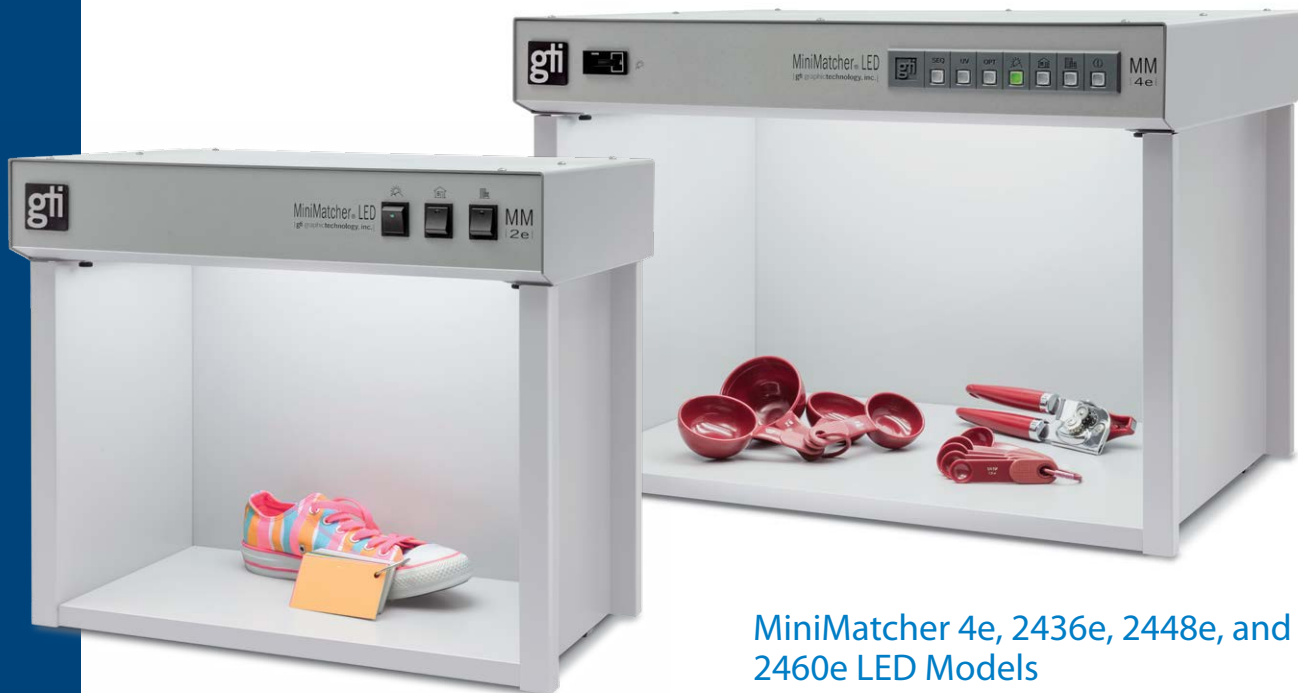
MiniMatcher MM-2e/LED (left) and MM-4e/LED (right)

Affordable Tabletop LED Color Matching and Inspection Systems