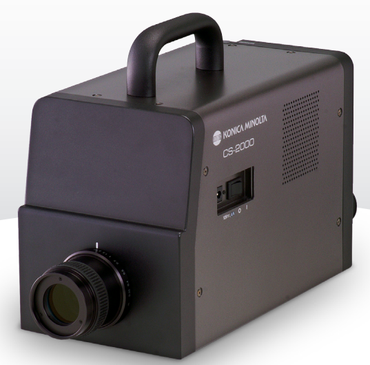
Konica Minolta CS-2000 Sprectroradiometer

When it comes to manufacturing color effect pigments for security and decorative markets, look no further than the Flex Products Group of JDS Uniphase. The JDSU is the worldwide leading provider of broadband test and measurement solutions and is also involved in other non-color shifting security pigments for use in pharmaceuticals to prevent counterfeiting.