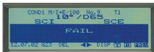
Quick and easy PASS/FAIL evaluation