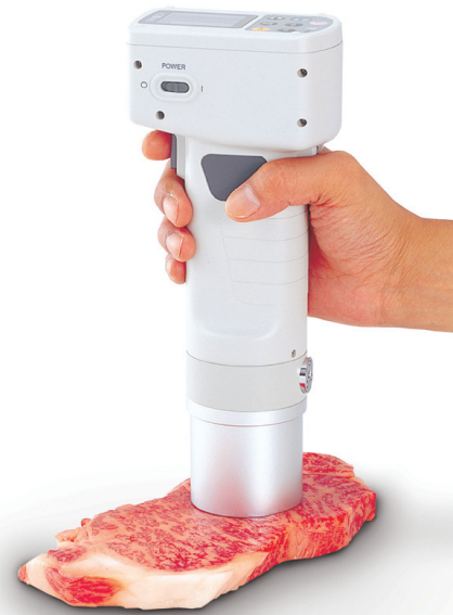
Sample measurement of meats, poultry, fish, purees, granules, powders

From ice cream, yogurt, and cheeses in the dairy section to lunch meats, sausages, and sauces, Konica Minolta Sensing Americas, Inc. provides food technologists with the color measurement solutions to ensure favorable "eye appeal" of their final product - a key ingredient to retail success.