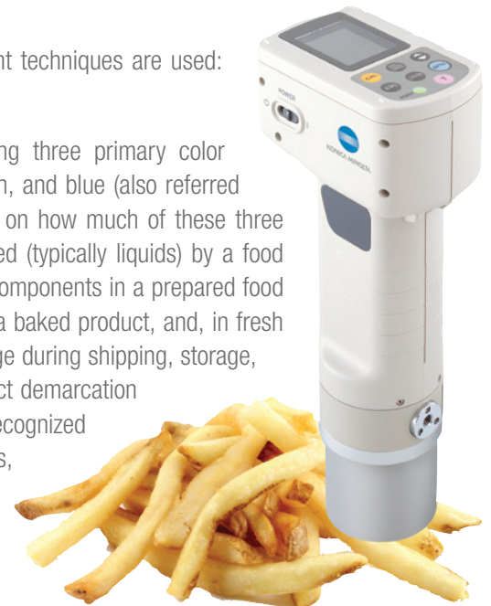
CR-410 Series Colorimeter

Colorimetry is the technique that quantifies color by measuring three primary color components of light seen by the human eye, specifically red, green, and blue (also referred to as "RGB"). This "tristimulus" color measurement provides data on how much of these three components are present in the light reflected (solids) or transmitted (typically liquids) by a food product. Such data may be used, for example, to adjust the color components in a prepared food or beverage recipe to improve "eye appeal," gauge "doneness" in a baked product, and, in fresh foods, to determine factors such as degrees of ripeness and spoilage during shipping, storage, shelf-life, palatability, and disposal cycles. Although there is no strict demarcation line where the benefits of colorimetry in foods ends, it should be recognized that it measures color much the same as the human eye. That is, secondary and tertiary colors such as orange, yellow, violet, tans, browns, etc. are not individually quantifiable. This leaves a variability factor that can hamper the consistent reproduction of a desired color in prepared food products formulated for a specific, consistently produced look.