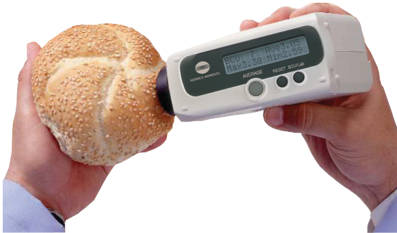
BC-10 Baking Contrast Meter

Visual color judgment is simply too subjective. Pepperidge Farm recognized the influence of color and appearance on consumer perception and the flavor profile of baked and fried products. Because of this, a strong focus was placed on incorporating objective standards and measurement techniques into their operations. Portable, hand-held, and battery-powered, the Konica Minolta BC-10 colorimeter eliminated the problem of subjectivity by establishing acceptable color contrast standards (the brightness of a baked or fried product) to communicate numerically to their production plants. Now, color standard and tolerance measurements at Pepperidge Farm are expressed in terms of Baking Contrast Units (BCUs). The Baking Contrast scale is calibrated so that a difference of one-tenth of a BCU corresponds to one perceptible difference in shade as perceived by a normal observer. The BC-10 colorimeter can also report in the commonly used CIE L*a*b* color space and scale units, measuring lightness and darkness in units from the darkest, 0, to the lightest, 100.