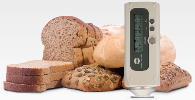
CR-14 Whiteness Meter

One would think that in manufacturing white pasta flour, the color wouldn't be much of an issue. Well, with every kitchen becoming a home gourmet's retreat, the surge in specialty flours and the homegrown sprouting of epicurean eyes and palates, it is now an issue - and one to be avoided.