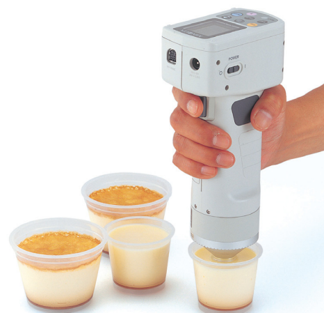
Sample measurement of custards, yogurts, puddings, jellies, jams

The art in the science of integrating color as a food quality component lies in the methodology developed and used by food producers and the food processors. In food science, technologies are developed in response to needs vocalized by food industry scientists and technologists. In Konica Minolta's Instrument Systems division, we view our role as being technologically responsive: that is, scientists and technologists foresee their color measurement and methodology goals and, in turn, we attempt to create and apply technologies to fulfill those needs. Over the last 20 years, we have moved through nearly four generations of technologies. The following examples demonstrate the continuing advancement of food color measurement, as well as provide hints as to how this technology may progress in the future.