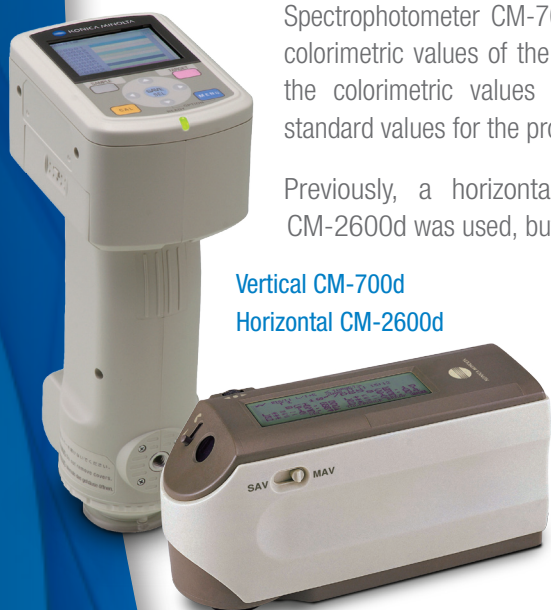
Vertical CM-700d Horizontal CM-2600d

Although the main application is determining the color of product masters as described above, there are also other applications for color measurement, some of which are introduced below.