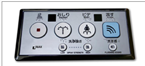
Control panel for public toilet

Since the standards specify the color of the buttons on the control panel and that contrast with surrounding areas must be ensured, the CM-700d is used in the design and layout of such panels.