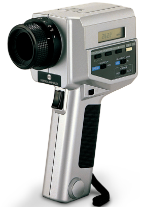
Luminance Meter LS-100

Since a luminance meter takes non-contact measurements, it has the problem of being affected by the brightness of the surrounding area. On the other hand, it also provides measurements under the actual brightness environment so that evaluation close to visual evaluation can be obtained.