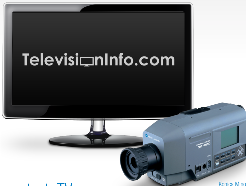
Konica Minolta CS-200